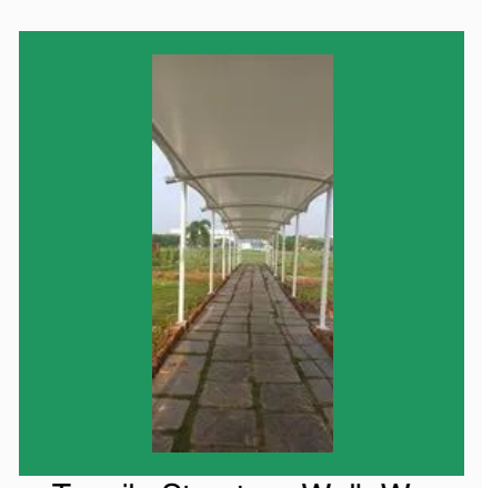
Tensile Structure Walk Way