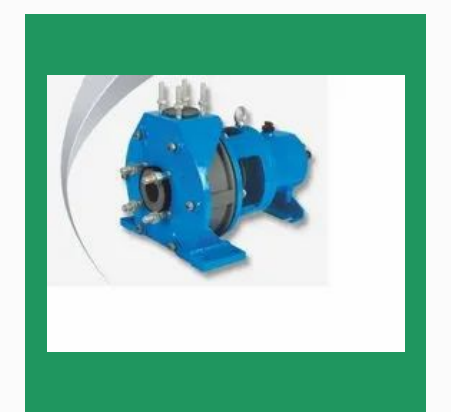
KRZ Solid PVDF