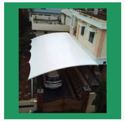
Modular PVC Tensile Canopy