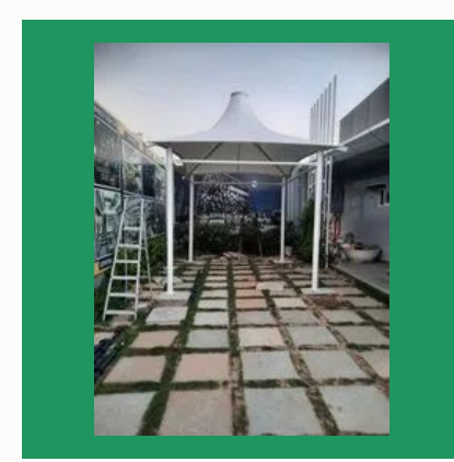
Modular Car Parking Structures