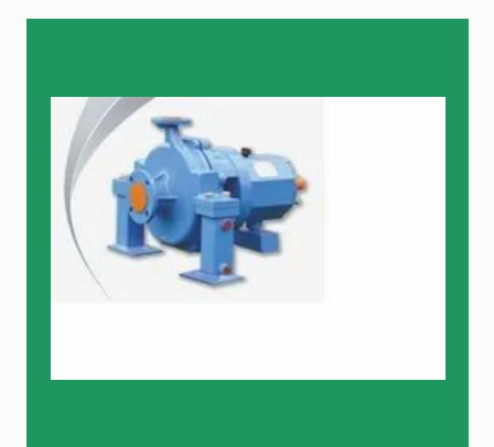
Metallic Centrifugal Pumps