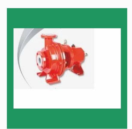
Pvdf Lining Centrifugal Pump