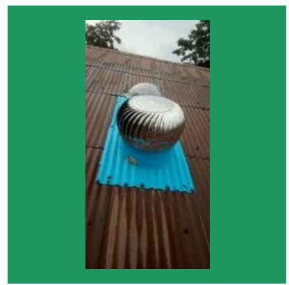
Solar Daylight System