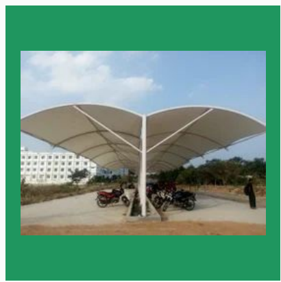
Mild Steel Parking Shed