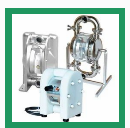
Air Operated Double Diaphragm Pumps