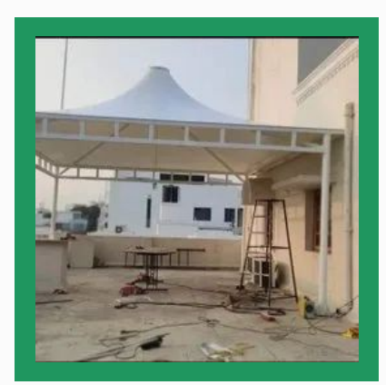
Gazebo Tensile Structure