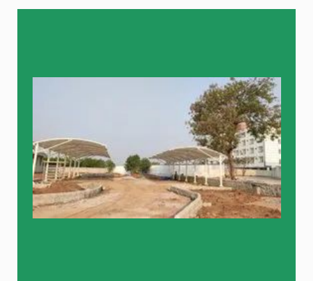
Canopy Tensile Membrane Structure