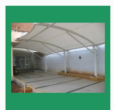
Industrial Car Parking Structures