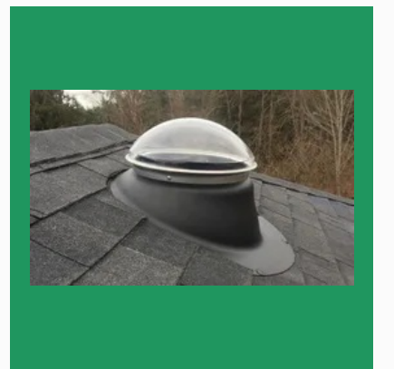
Norikool Day Lighting Harvest System