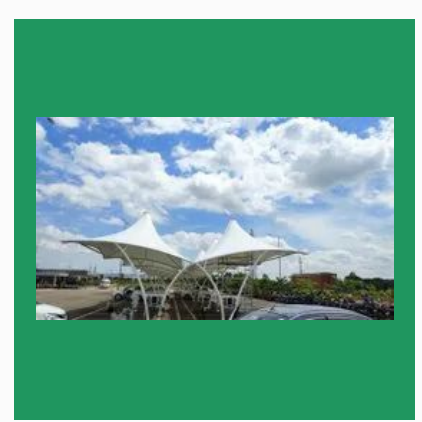
Gazebo Tensile Membrane Structure