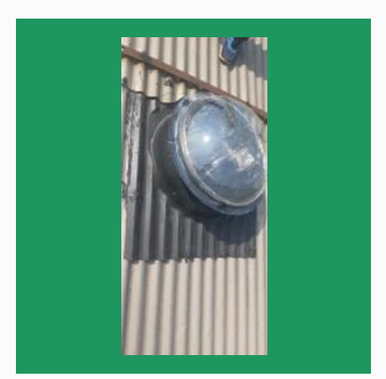
Daylight Harvesting System